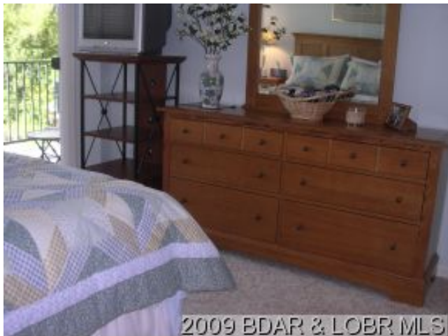
2009 BDAR & LOBR MLS Master Bedroom