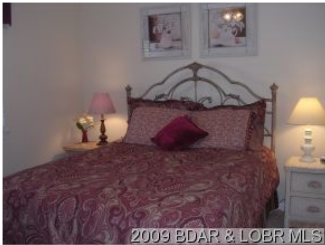
2009 BDAR & LOBR MLS 2nd Bedroom