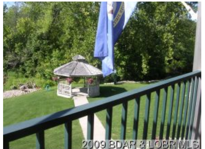
2009 BDAR & LOBR MLS Walkway to Gazebo