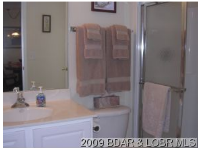
2009 BDAR & LOBR MLS 2nd Bath

--- These properties were selected from the MLS database by the agent listed herein, who may not be the listing agent. ---