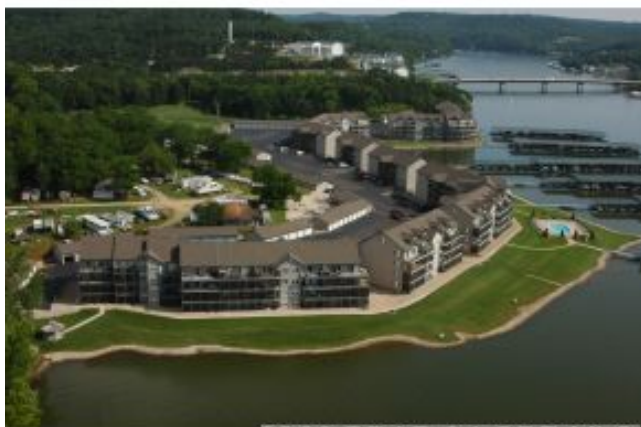
2009 BDAR & LOBR MLS Cedar Glen Aerial View