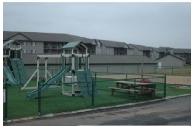
2009 BDAR & LOBR MLS Playground